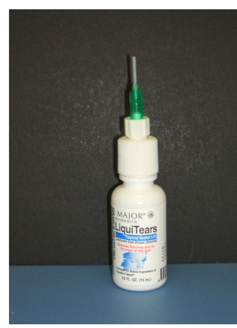
Figure 1: Top: 1.5" 0.250 mm bore dispenser Middle: 0.5" 0.840 mm bore dispenser. Bottom: 0.5 " 0.840 mm bore dispenser with Luer lock cap affixed to a commercially available 0.5 oz artificial tear bottle.

All tips are composed of flexible polypropylene.